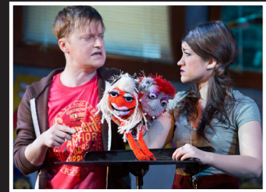
Hand to God