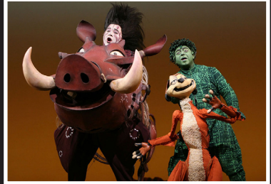
The Lion King