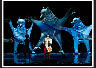
The Magic Flute